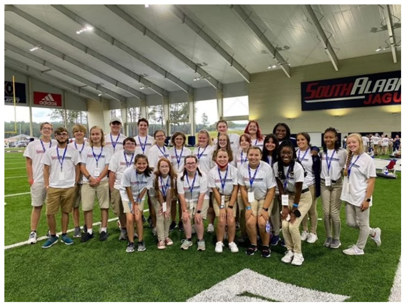
students at JMB Honor Band