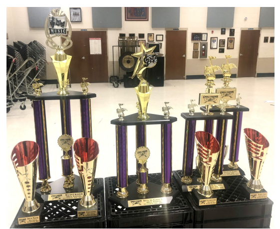
Little Big Horn awards